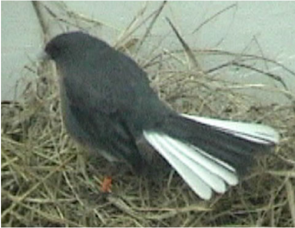
Fig. 1 Tail spreading behaviour of a male dark-eyed junco. During courtship, males erect their body plumage and spread their tail to reveal the white patch on their outer tail feathers, which is mostly hidden at rest. Testosterone increases the frequency of this display, and increasing the size of the patch increases its attractiveness to females. Males also display their tails during intrasexual interactions, and males with more tail white are socially dominant.

behaviour. This covariation between signal, physiology and behaviour would suggest that potential competitors and mates should be able to predict the outcome of interactions with an individual by assessing his ornamentation.